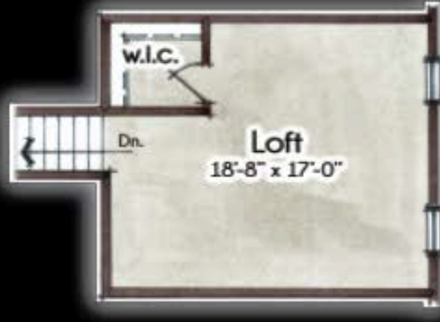
Opt. Loft +340 Sq. Ft. Opt. 2nd Floor