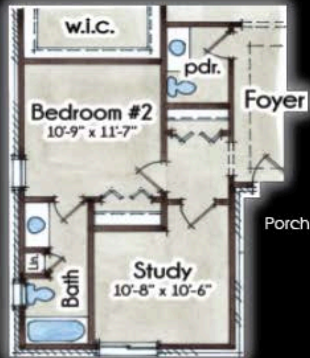
Opt. Study With Loft or 4th bedroom options