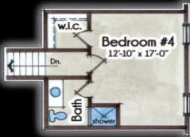
Opt. 4th Bedroom +340 Sq. Ft. Opt. 2nd Floor